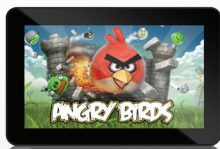
Capacitive Touch Screen

The i DISPLAY Retail Tablet M is an Android based, interactive digital display with hardware and software specially designed for retail and commercial use. The i DISPLAY Retail Tablet M is a robust yet slimline unit that features a 10.1" capacitive multi touch screen, front camera and embedded Wi-Fi and 3G to allow remote automatic connection to content management system (CMS). The i DISPLAY Retail Tablet M features include content auto-play, auto-copy, auto-detect and password protection functionalities. Battery life is maximized due to the internal and external batteries and the stand-by mode. A VESA mounting system on the back enables various mounting solutions for the retail environment. Setting buttons and sockets are placed at the back of the device to prevent customers from modifying the preferred settings. The i DISPLAY Retail tablet M can connect to external hardware such as a coupon printer, barcode scanner and can run a multitude of Android applications to reinforce marketing messages and promotions within the retail space. The i DISPLAY Retail Tablet M offers the ability to work in either landscape or portrait mode, comes with a variety of fixtures, and is the ideal digital point of sale display for retailers looking for an affordable interactive digital signage solution that fits nicely in any location and provides great visibility from a distance!