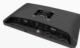
Built for Retail