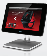
Variety of Fixtures