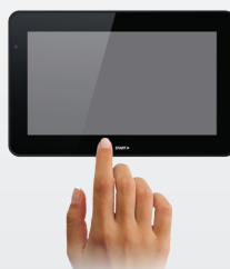
Energy Saving Standby Mode