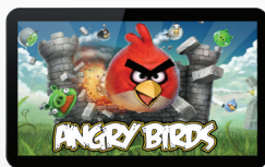
High Quality Touch Screen

The i DISPLAY Retail Tablet XXL is an Android based, interactive digital display which is specifically built for retail and is the only retail tablet at this unique size. The i Display Retail Tablet is a robust yet slimline unit that features a high quality 21.5" touch screen integrated within tempered glass to ensure durability and effectiveness. The embedded Wi-Fi enables remote automatic connection to content management system (CMS). i DISPLAY Retail Tablet XXL software and hardware have been designed for commercial and retail use and include important features such as content auto-play, auto-copy, auto-detect and password protection functionalities. A VESA mounting system on the back enables various mounting solutions for the retail environment. Setting buttons and sockets are placed at the back of the device to prevent customers from modifying the preferred settings. The Retail tablet can connect to external hardware such as a coupon printer, barcode scanner and can run a multitude of Android applications to reinforce marketing messages and promotions within the retail space. The i DISPLAY Retail Tablet XXL offers the ability to work in either landscape or portrait mode, comes with a variety of fixtures, and is the ideal digital point of sale display that is sure to grab customers' attention and gives them the ability to view and interact with your content on the largest retail tablet available.