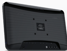
Built for Retail