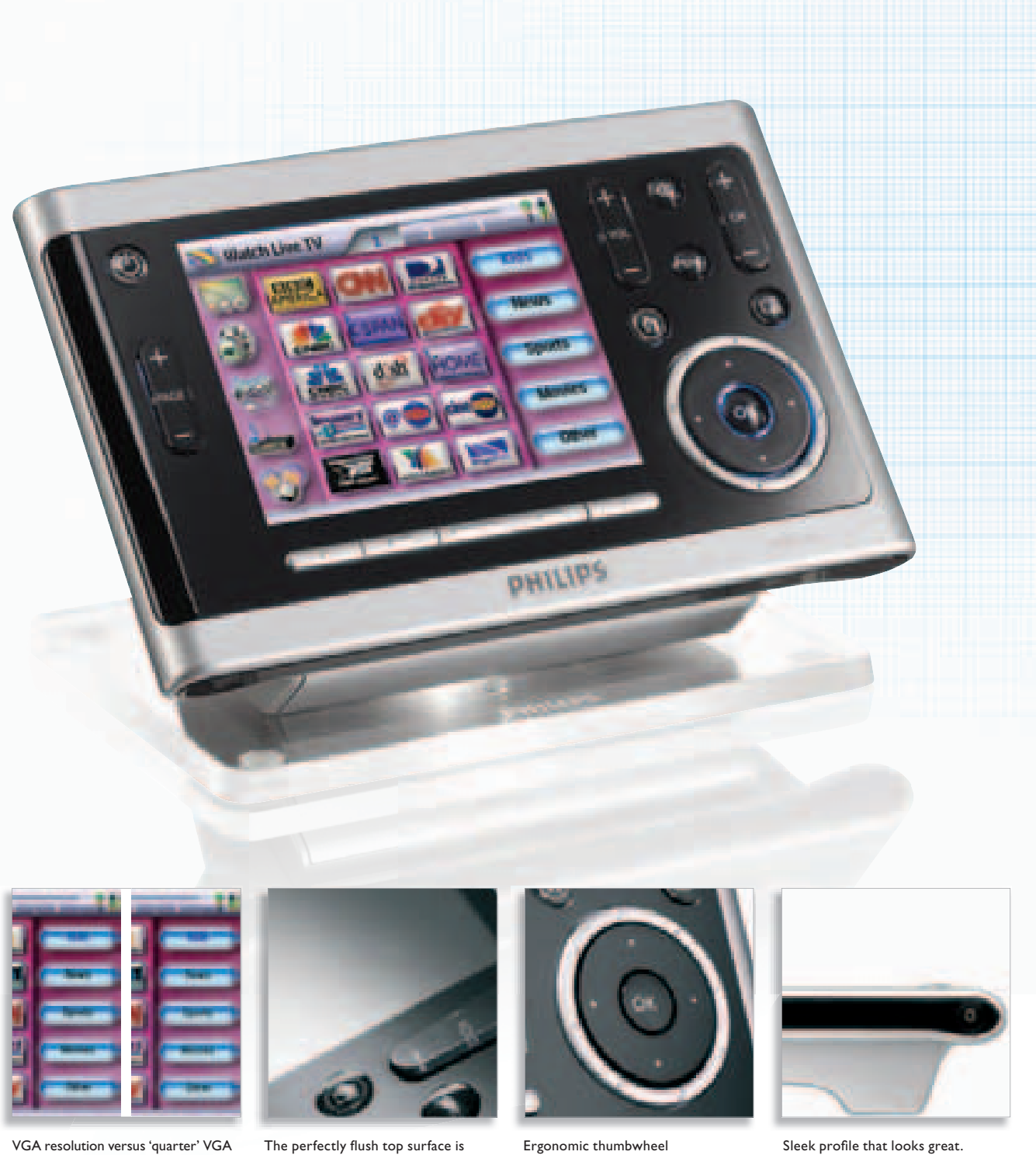
elegant, practical and unique